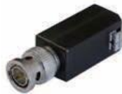
DS-1H18 Video Balun