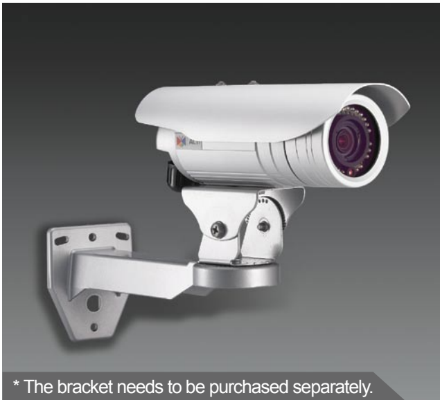
* The bracket needs to be purchased separately.